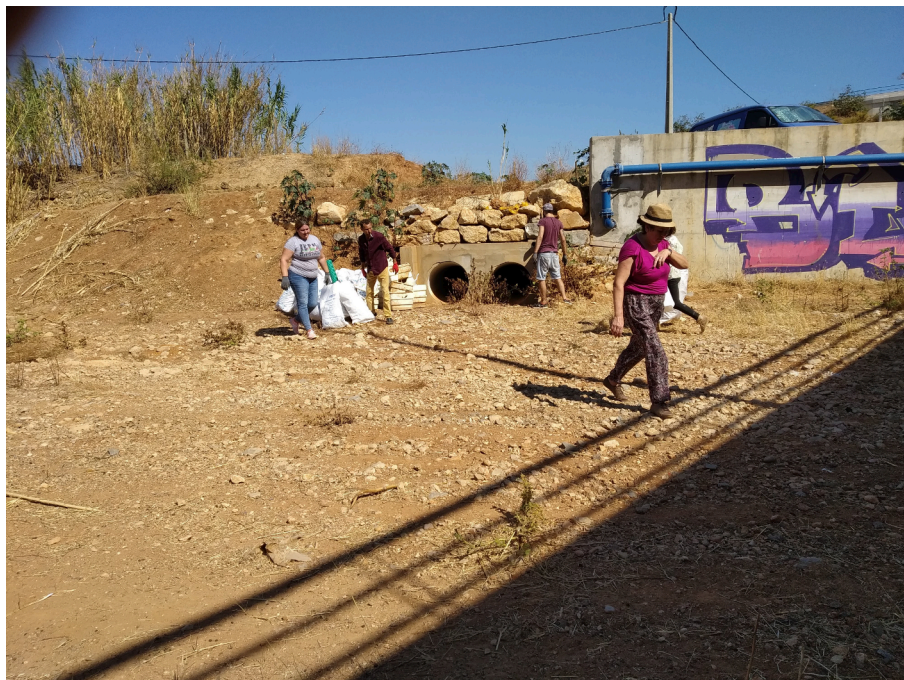
Fig. 3. Photo of the Action of cleaning the Rio Seco on September 26th 2018 (during Scientific Training Short Mission from Cost Action SMIREs by Pastor AV).