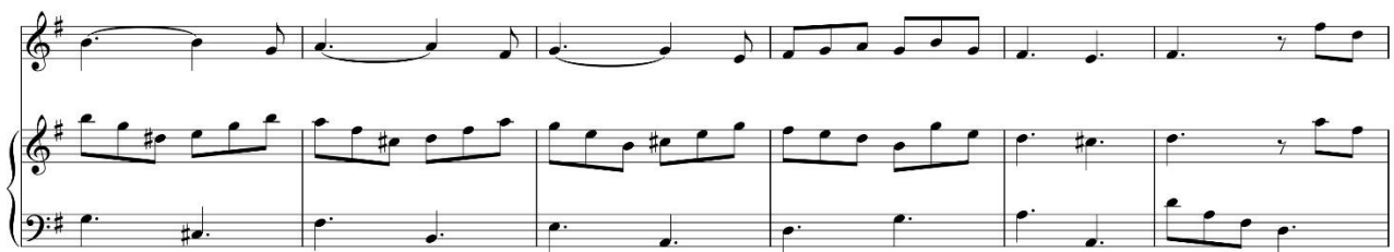
Ex. 10b. Francisco Xavier Baptista, second movement of Sonata prima , excerpt of the first episode, bb. 43–8.

In the second movement of Sonata prima , the keyboard part leads the sequential progressions of the refrain and the first episode, which produce the galant schema Prinner (Exx. 10a–b). 36