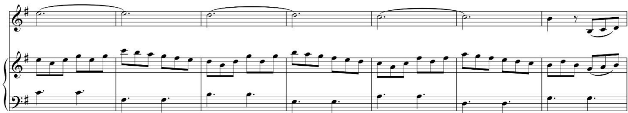
Ex. 10a. Francisco Xavier Baptista, second movement of Sonata prima , excerpt of the refrain, bb. 21–7.