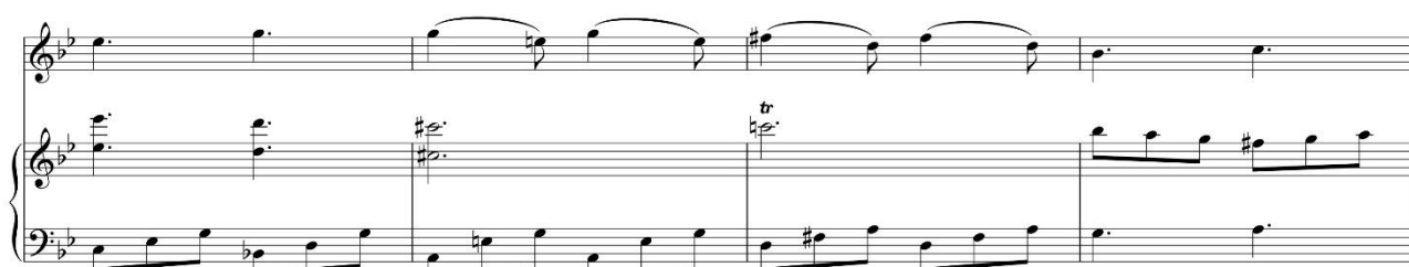
Ex. 12a. Francisco Xavier Baptista, second movement of Sonata prima , bb. 87–90.