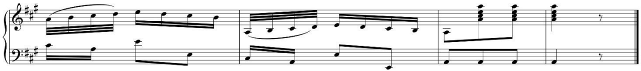
Ex. 8a. Francisco Xavier Baptista, first movement of Sonata X in A major (P-La, 137-I-13), end of the movement, bb. 126–9.