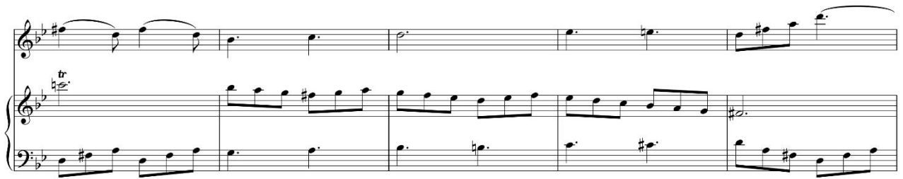
Ex. 9a. Francisco Xavier Baptista, second movement of Sonata prima , bb. 89–93.